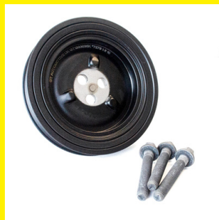
GT1333035K For Ford 2.2 TDCi 2006-