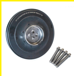
GT1304519K For Mini N47C16 2009-2016