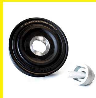
GT1345069K For Renault 2.3 CDTi 2010-